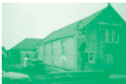
Memorial Hall prior to demolition.