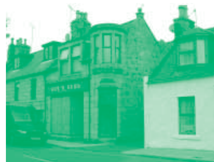
A closed shop on Main Street.