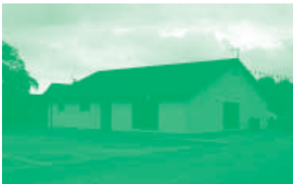
Community Pavilion at McRobert Park.