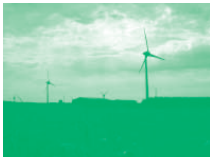
Boyndie Wind Farm.