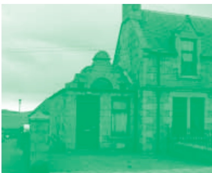
Former Police Station.