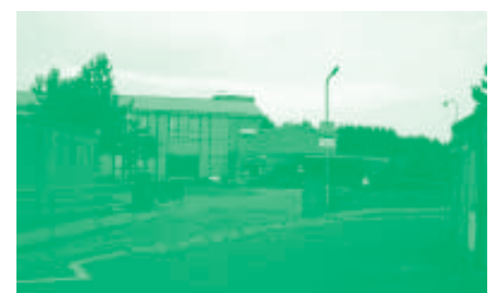
Aberchirder Primary School.