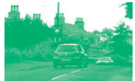
Traffic on South Street.