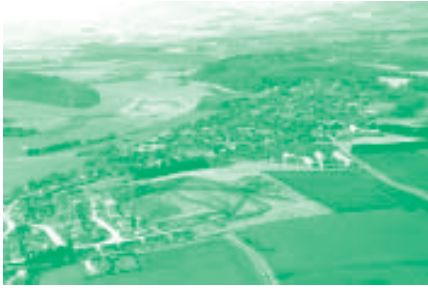
Aerial view of the village.