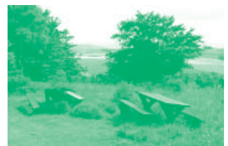
Vandalism to picnic site at Cleanhill Wood.