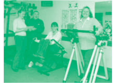
Working out in gym in Community Pavilion.