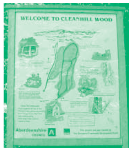
Sign at Cleanhill Wood.