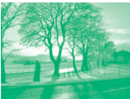
Eastern entrance to the village.