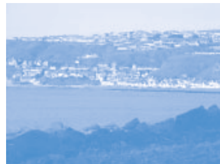
Gardenstown from bottom of Mohr Head.

Some concern has been expressed about antisocial tenants , both private & council. [H&SW, GP, CSP]