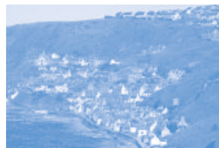
Gardenstown from St John's Kirkyard.