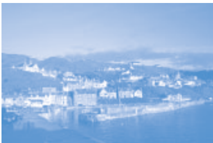
Gardenstonw harbour from end of west pier.