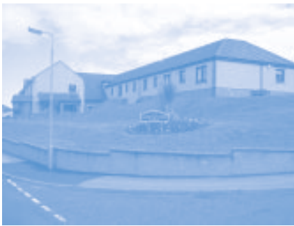
Gamrie Bay Court.