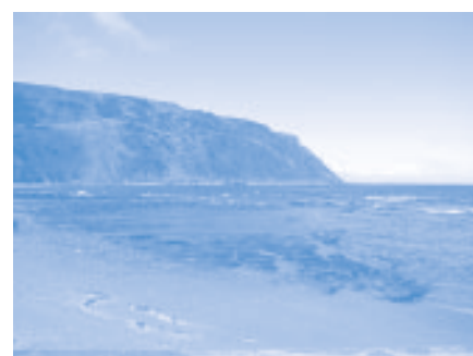
Beach looking across to Mohr Head.