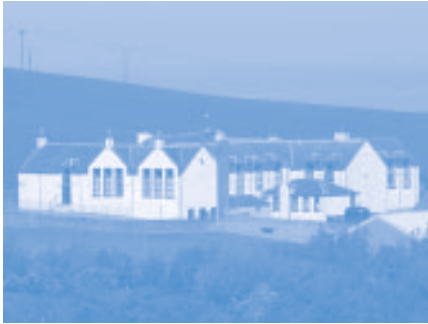
Bracoden Primary School.