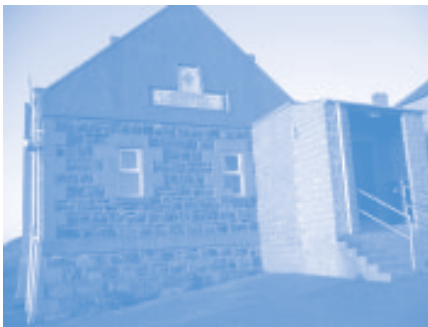
Gardenstonw Village Hall.