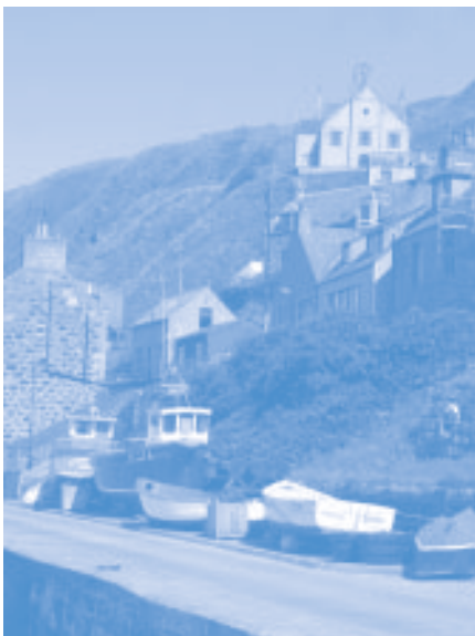
Road along harbours' edge.