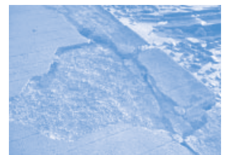
Damage to seawall/road.