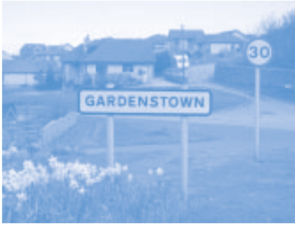
Entrance to village.