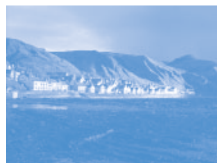
Seatown from beach.