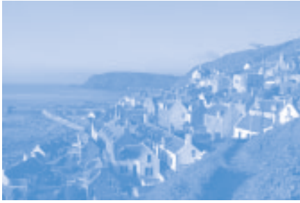
Gardenstown from Quarry Path above Seatown.