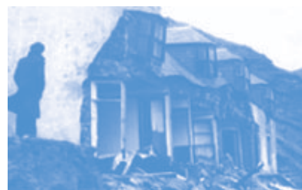
Storm damage at Seatown, Gardenstown, 1953.