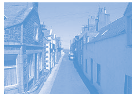
Main Street, Gardenstown.

A common issue raised in the consultation is that the laird should take responsibility for his land & buildings . The amount of litter left in verges in and outside the village also has attracted criticism. [P&ES]