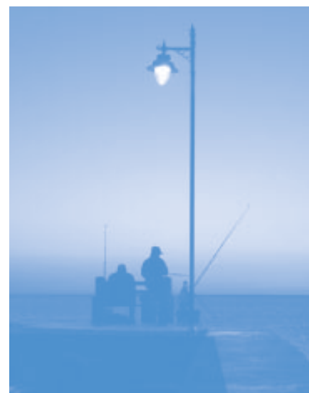
Fishing from the end of the pier.