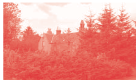
1860 Old School.