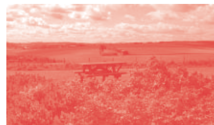
Rural view from the picnic area.

A popular suggestion in terms of recreational facilities was for a grass bowling green for use by all ages, which could act as an attraction for young people to remain in the village. However the cost would be well beyond the resources of the community.