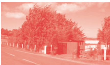
Taking a pride in the environment.