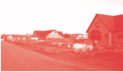
New houses being built in Urquhart Road.