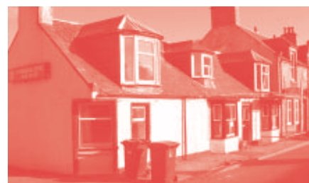
Commercial Hotel (now a pub).