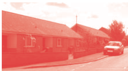
Council housing in Old School Road.