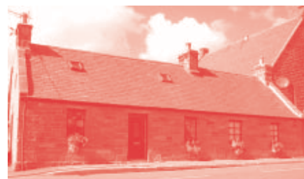
An original cobbler's cottage which would have had a thatched roof.

The playing field and picnic area in School Road belongs to the village. The Playing Field and Community Association has planted Millennium trees in the picnic area, a cherry blossom and Christmas tree in the Square and created flower display areas incorporating steam engines to reflect the fact that New Byth holds an annual Steam & Vintage Rally. The association has also provided a car park at the cemetery. Residents take a pride in the village and work as a community, not only to care for the flower tubs, but to actively care for each other.