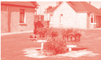
Steam roller floral display in the Square.