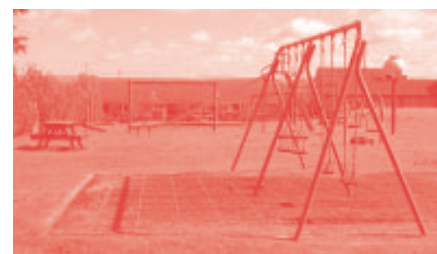
Children's playing equipment beside the football pitch.