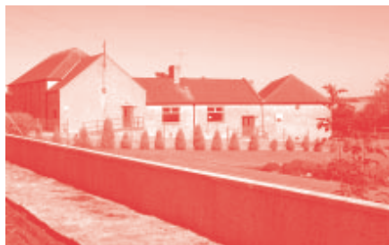
New Byth School opened 1939 now closed down.