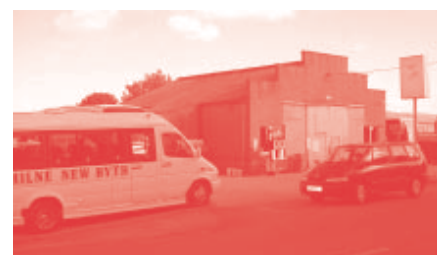
Milne's bus garage.