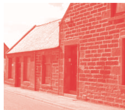
Shops turned into houses.