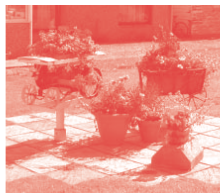
Floral engine in the Square.