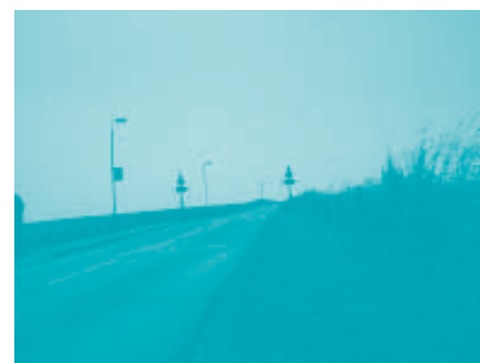
End of the pavement - B9121.