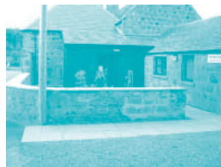
Boyndie Visitor Centre.