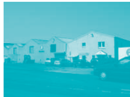
Downies of Whitehills - A major employer.

No proposals were forthcoming on this theme, suggesting that Banff, just two miles away and connected by a main bus route, provides access to enough facilities for most Whitehills inhabitants.