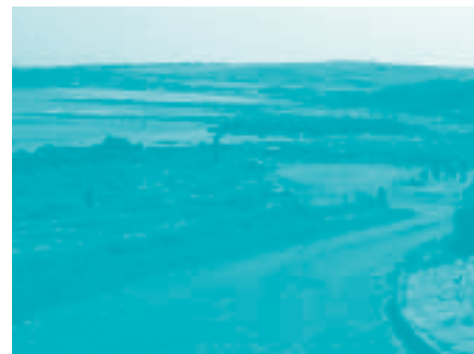
RedWell picnic area.