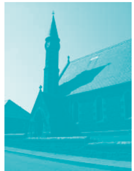
The clock on Whitehills Parish Church.