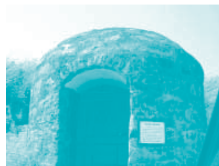
The Red Well.